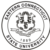
Navy Blue/Pantone® 289 or Black is acceptable

The Eastern Connecticut State University seal is used for certain traditional purposes such as honorary degrees and Admissions certificates and only with University Relations approval .