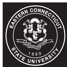
Reversing the seal is not acceptable